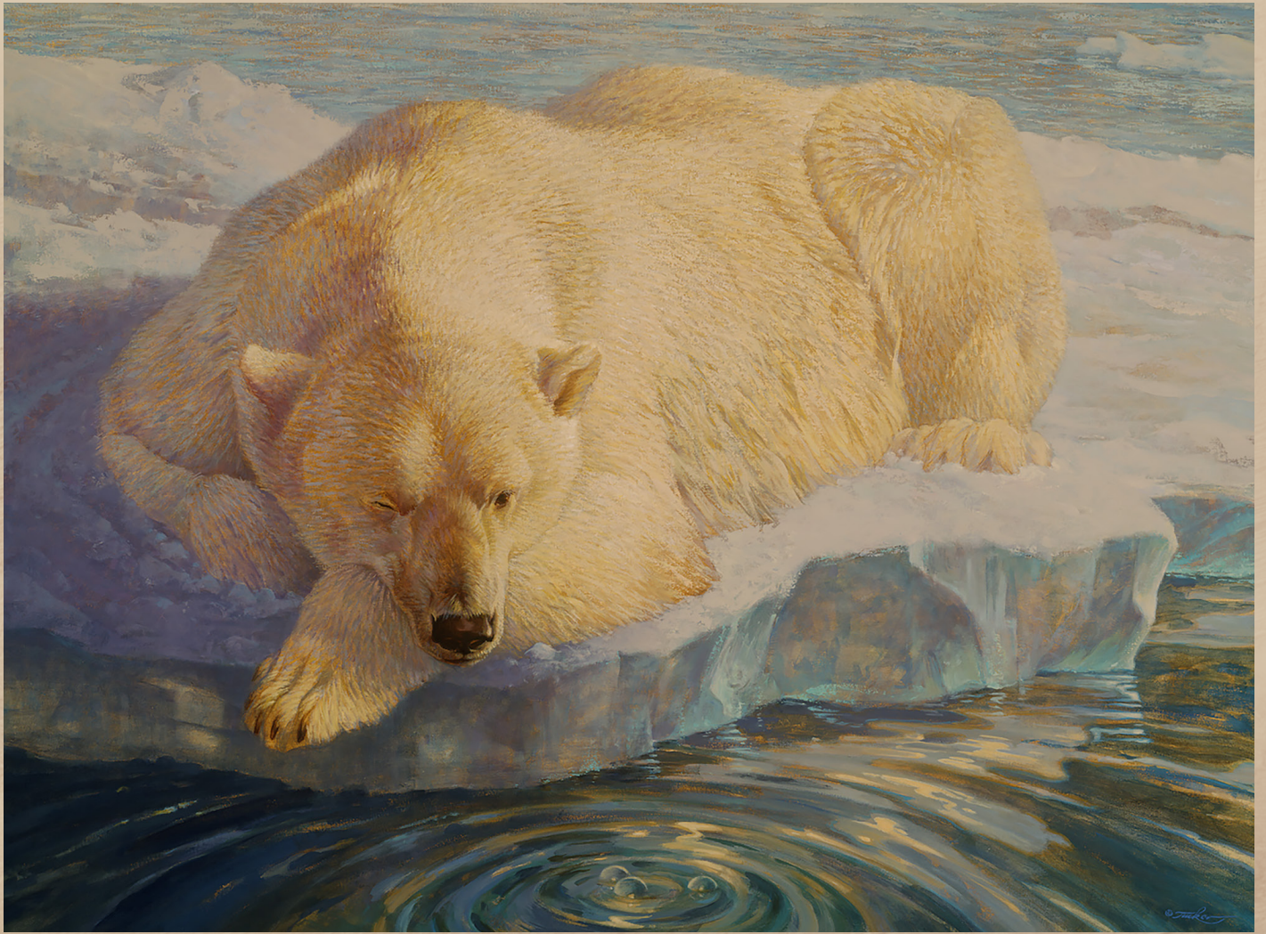
Artwork this page: Slow Melt . Front cover: Ezra Tucker pictured with Crown of Horns and Solitary Challenger .

back. The complete story of the life of Ezra Tucker is like a screen play for a feature length film. But it is his art, particularly the quality of his wildlife art, that is most notable in terms of achievement.