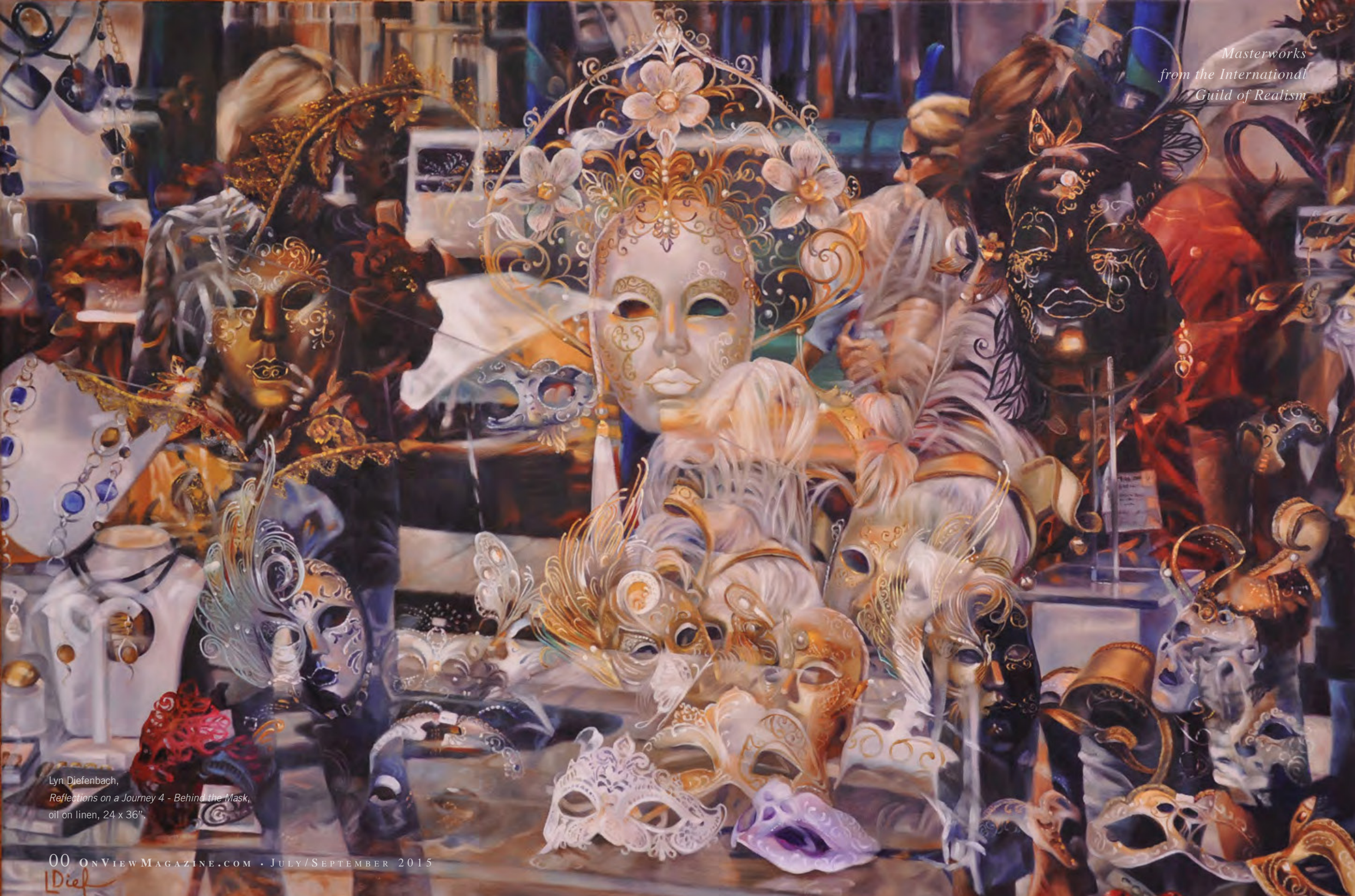
Lyn Diefenbach, Reflections on a Journey 4 - Behind the Mask , oil on linen, 24 x 36".