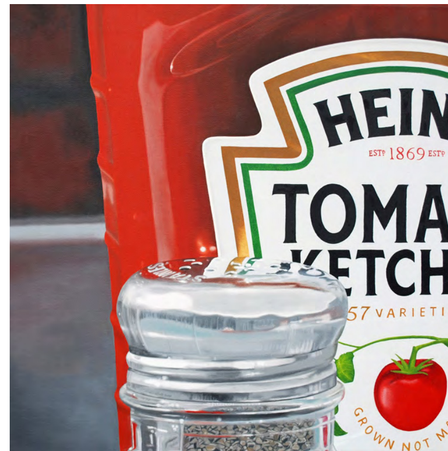
Opposite: Ken Scaglia, Saratoga 300 , acrylic on canvas, 36 x 24”.