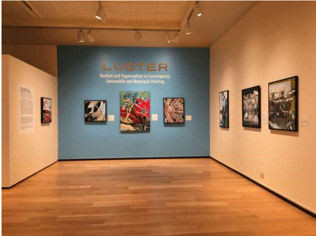
LUSTER on Tour Michele and Donald D'Amour Museum of Fine Arts Springfield, Massachusetts