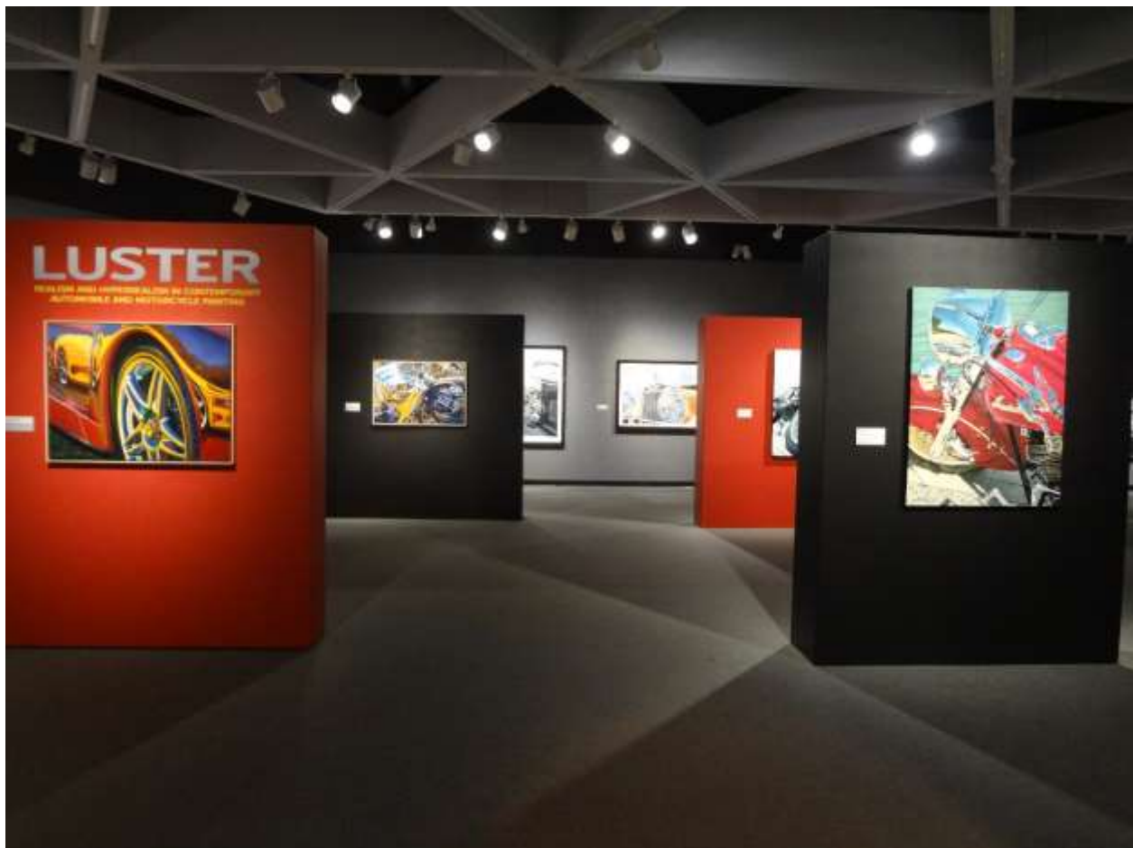
LUSTER World Premiere Museum of Arts and Sciences Daytona, Florida

https://www.davidjwagnerllc.com/Luster_Exhibition.html