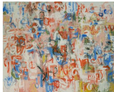
Abstract, Pick Pocket, 2013, Oil, Graphite on Canvas, 84x104