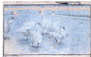
Impressionistic, Out of the Dimness They Sounded, 1998 Oil on Canvas, 54x95