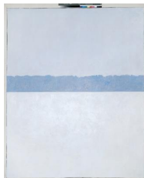
Minimalist, Snow Buntings 2002, Oil on Canvas, 110x88