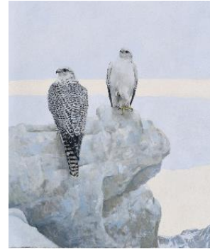
Layered, Minimalist & Realistic Northern Vigil, Gyrfalcons 2016, Oil on Canvas, 50x55