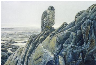
Batemanesque, Gyrfalcon, 1982, Acrylic on Masonite, 36x48